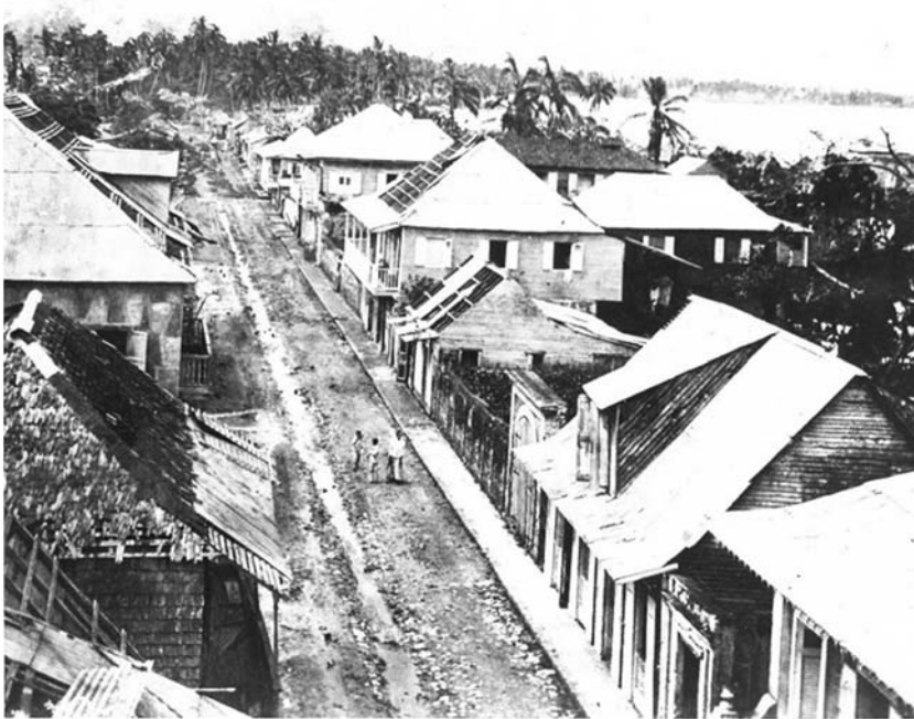
▲ Figure 5. Photo from San Juan archives looking south from the south end of Calle Betances (near location 9 in Fig. 2) in 1899.

the structure remaining. Figure 4, from Puerto Rico Ilustrado issue number 452, shows shoreline damage in the La Ñamera district, whose exact location is unknown, but from the shoreline in the background is probably near where modern Calle Rogelio Castro (Fig. 3) meets the sea. Evident from this photo is that some houses were knocked off their stilt foundations, but they remained more or less intact and could be moved back to their original locations, as confirmed in some of the damage reports. Another observation is that palm groves and other vegetation