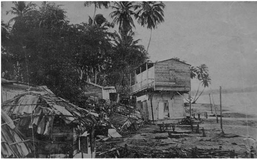
▲ Figure 4. Photo from Puerto Rico Ilustrado number 452, showing shoreline damage near zone 3 in Figure 2.